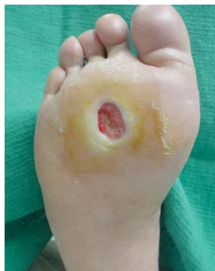
Figure 3. Neuropathic ulcer secondary to neuropathy and deformity in a diabetic patient.

problems including peripheral neuropathy. Patients should be counseled on the risk of developing neuropathy. About 80% of all patients with diabetes experience lack of sensation that is combined with repetitive stress with tissue break down and then eventually infection. 30 Patients with diabetic neuropathy alone are 1.7 times more likely to develop pedal ulcerations and are 12.1 times more likely to have foot deformities. 31 The etiology of diabetic neuropathy is not clearly understood, but one major theory has been described as angiopathy of the vasa nervosum causing ischemia of the nerve. Evidence of the metabolic disturbance has been found, including the accumulation of intraneural sorbitol and glycosilation of the nerve protein and reduction of