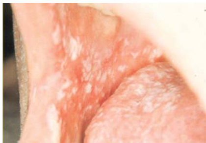
Figure 4. Candidiasis. Slide from "Diabetes and the Dental Professional"

Poor glycemic control has been associated with the predisposition of diabetic patients to infections. The presences of high levels of glucose in the bloodstream decrease the ability of leukocyte chemotaxis, and phagocytosis. In general, blood glucose of 250 or more place the patients in a compromised situation