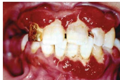
Figure 5: Periodontal Abscess/ Type 1 Diabetes Mellitus Slide from "Diabetes and the Dental Professional"

In addition to eye and foot changes, there are multiple oral signs and symp-