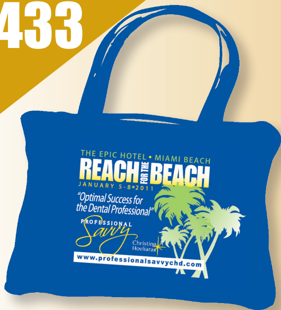
Exhibit Booth #433

Dental Hygienists come visit the Professional Savvy Exhibit Booth to learn more about Professional Savvy's consulting services, the 2011 Professional Savvy Symposium for Dental Professionals and Dental Teams and Professional Savvy's new textbook for student dental hygienists, faculty members and practicing dental hygienists that will be launched in 2011.